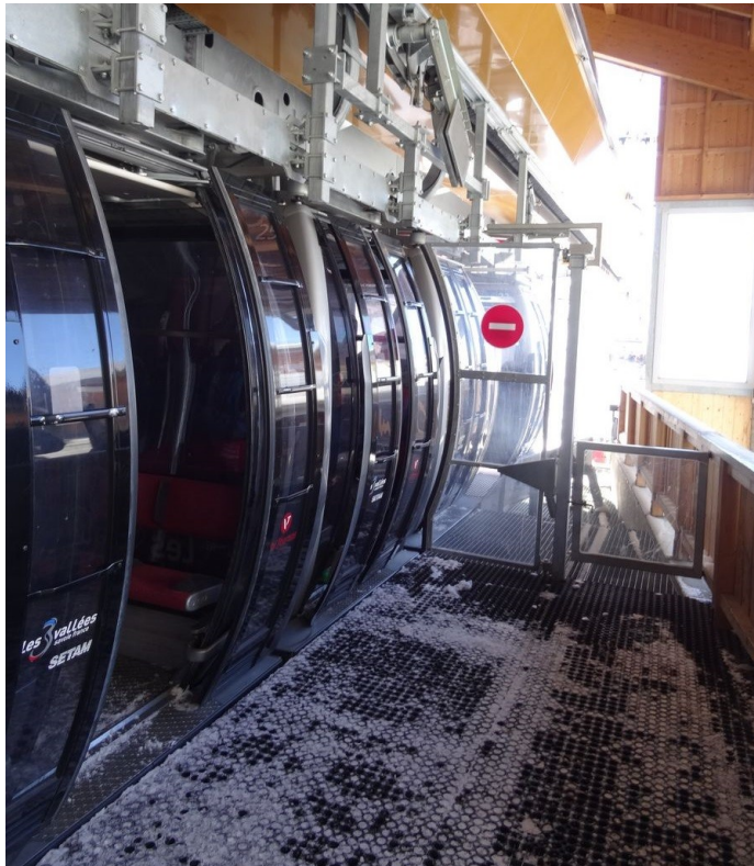
→ TC Cairn-Caron, top of Cairn station