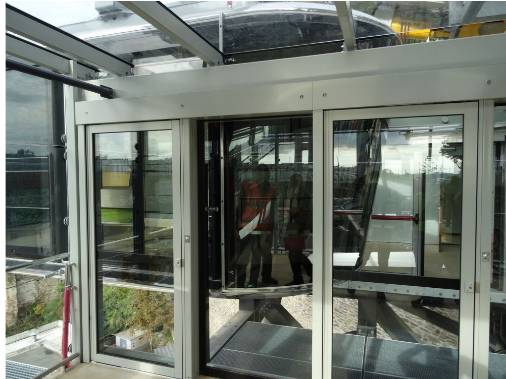
→ TPH Brest, Jean Moulin station