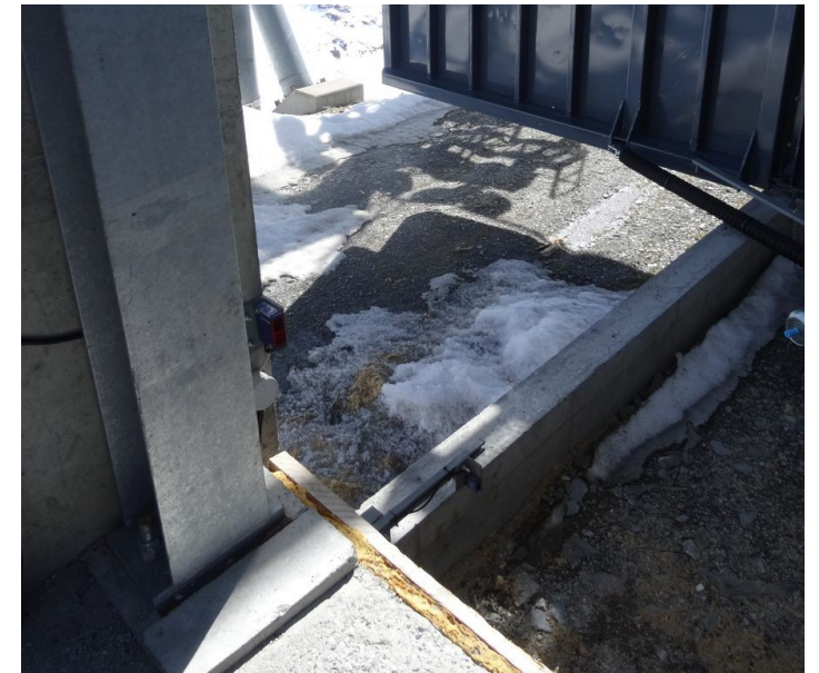
→ FT Trois Vallées – Bouquetin : bottom pit and platform detection cells