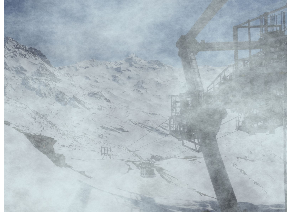
→ FT Bouquetin