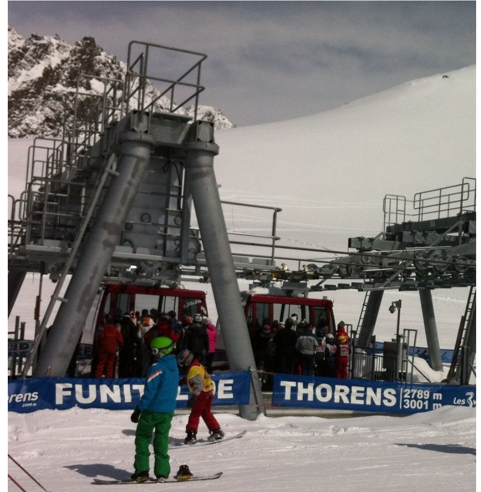
→ FT Thorens