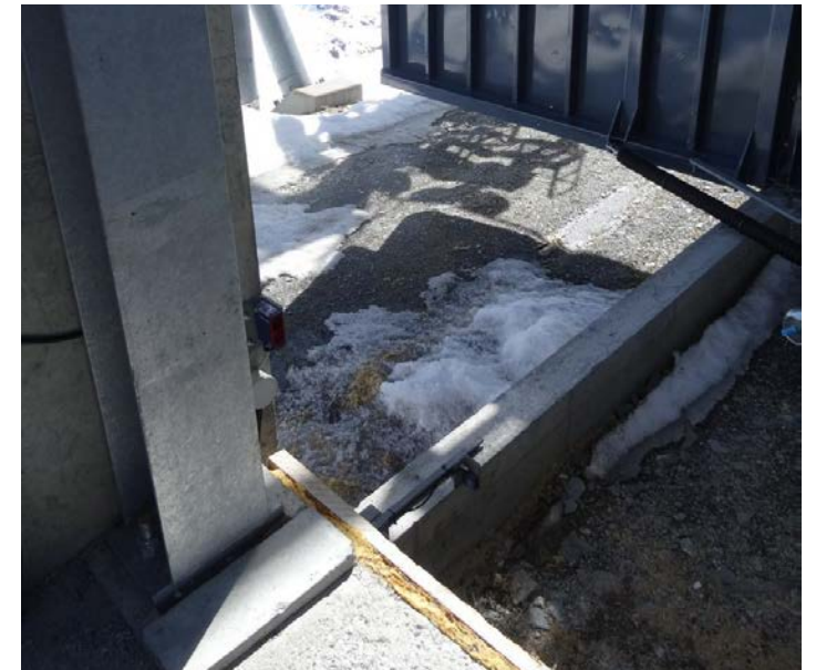
→ FT Trois Vallées – Bouquetin : bottom pit and platform detection cells