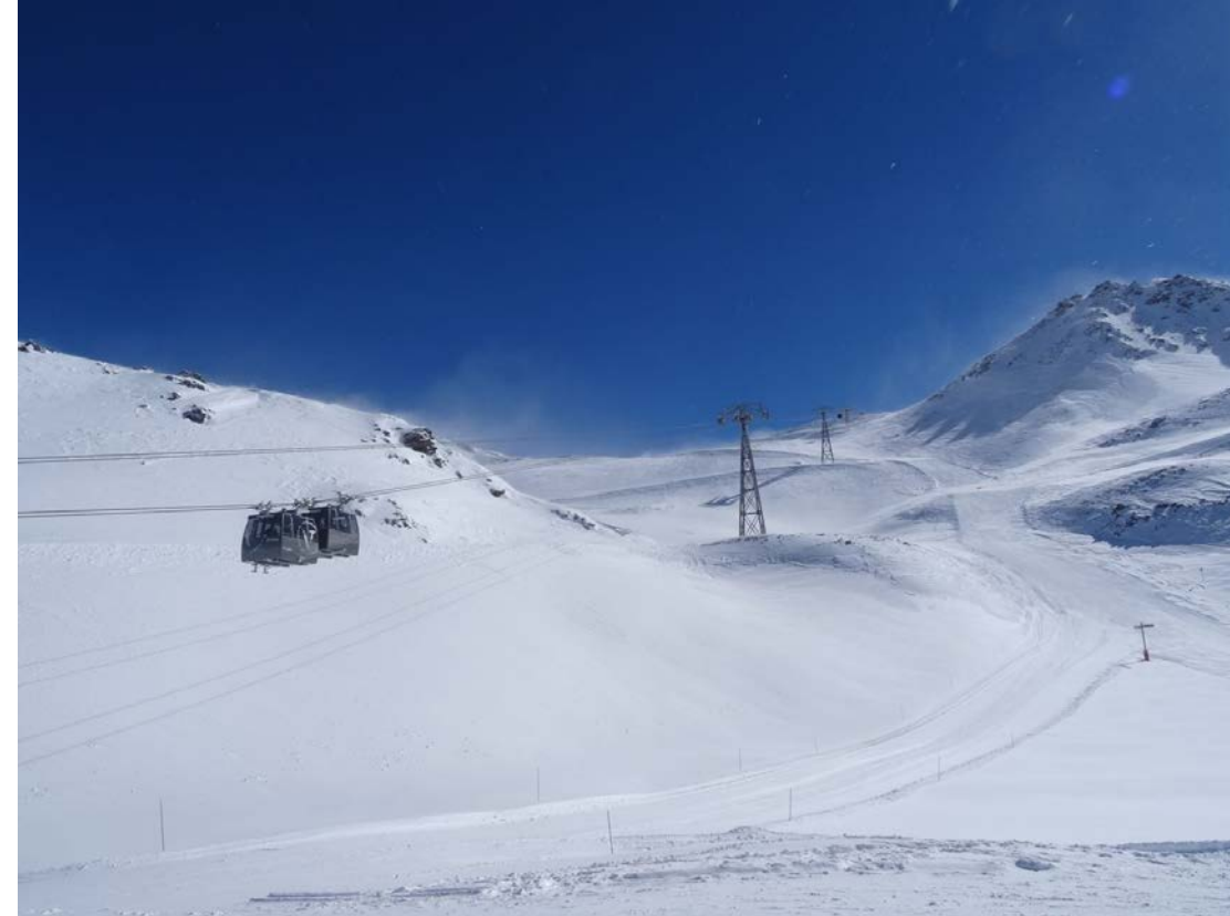
→ FT Thorens : photo taken from chairlift Portette top station, operator position