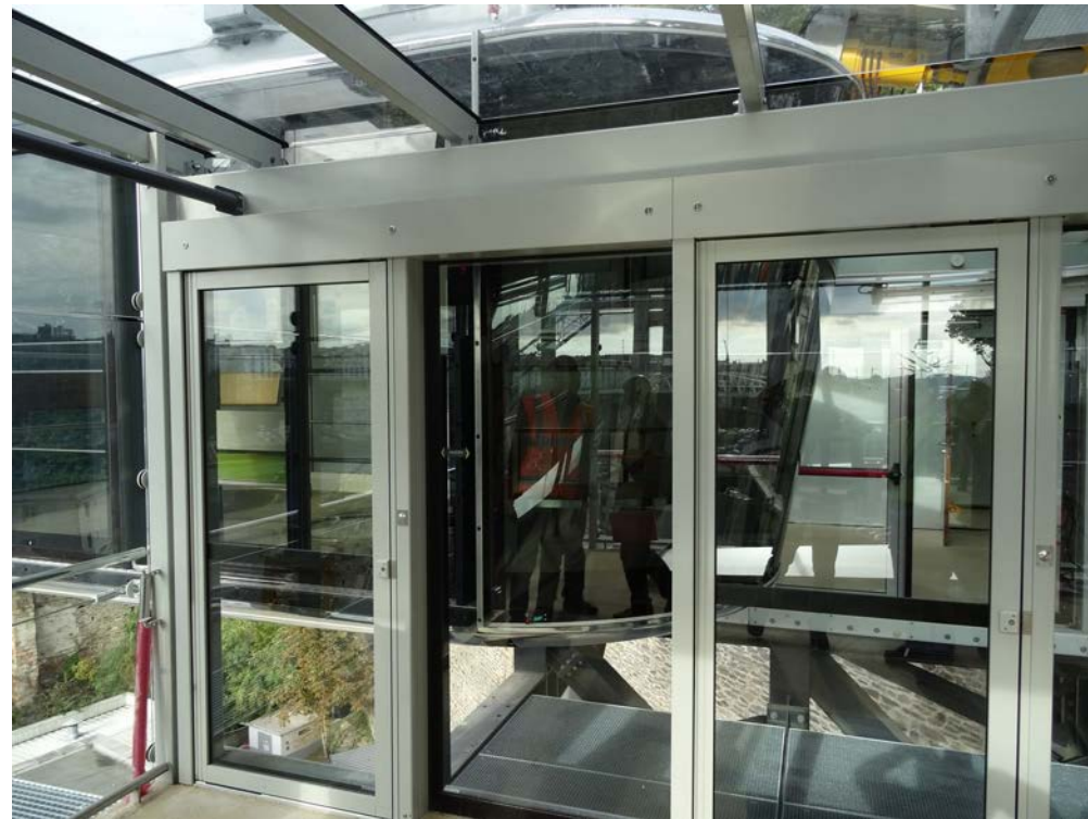
→ TPH Brest, Jean Moulin station