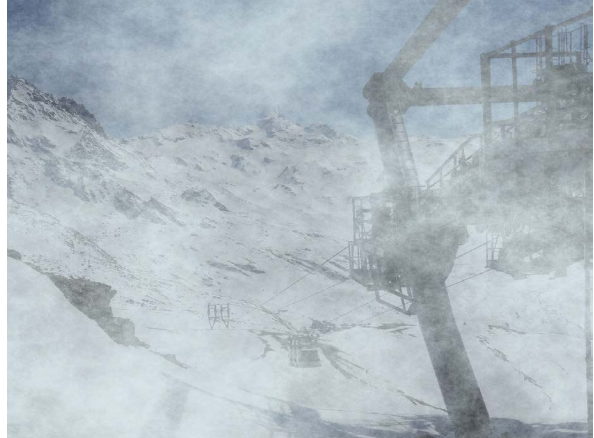
→ FT Bouquetin