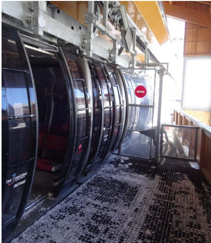
→ TC Cairn-Caron, top of Cairn station